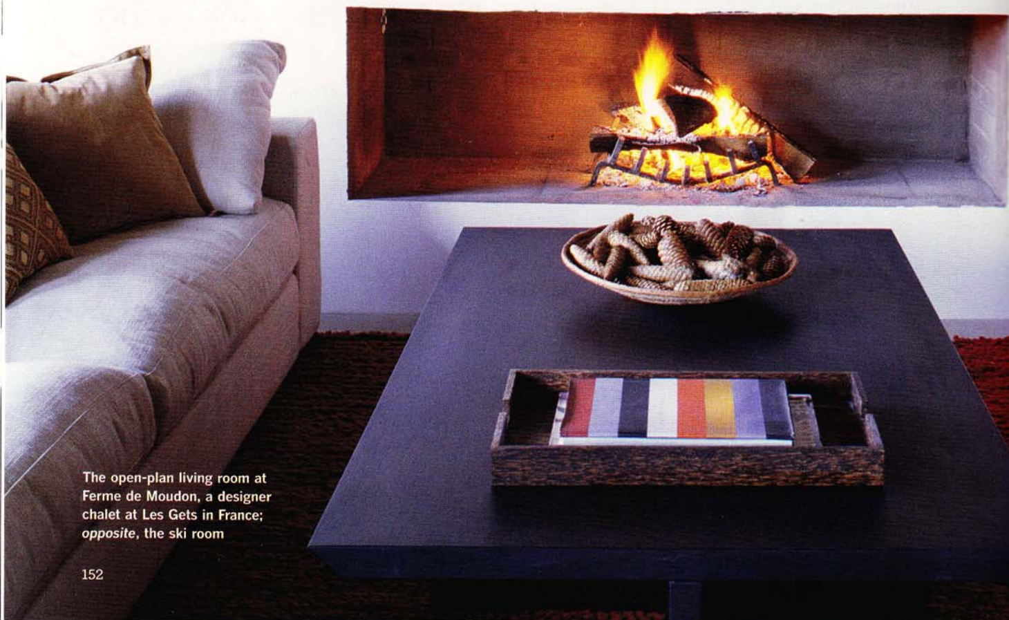
The open-plan living room at Ferme de Moudon, a designer chalet at Les Gets in France; opposite, the ski room

THESE STYLISH MOUNTAIN DENS ARE SUPPLIED WITH EVERYTHING FROM WINE CELLARS TO MINI-CINEMAS, SPA TREATMENTS TO GOURMET FOOD, AND EVEN A REVOLVING BED. YOU'LL HARDLY WANT TO HIT THE SLOPES. BY BELINDA ARCHER